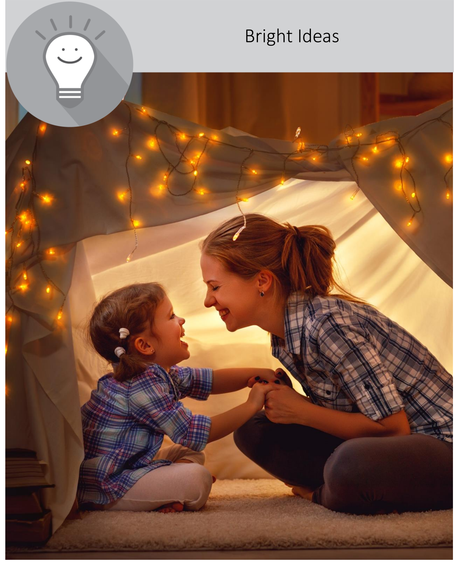
Regular dental care, from cleanings to crowns, are essential to your smile's health. Fortunately, you have a great service plan—your child's dental coverage. This section highlights key features built into your child's coverage and helpful tips to make your child's dental visits easy - and more affordable.