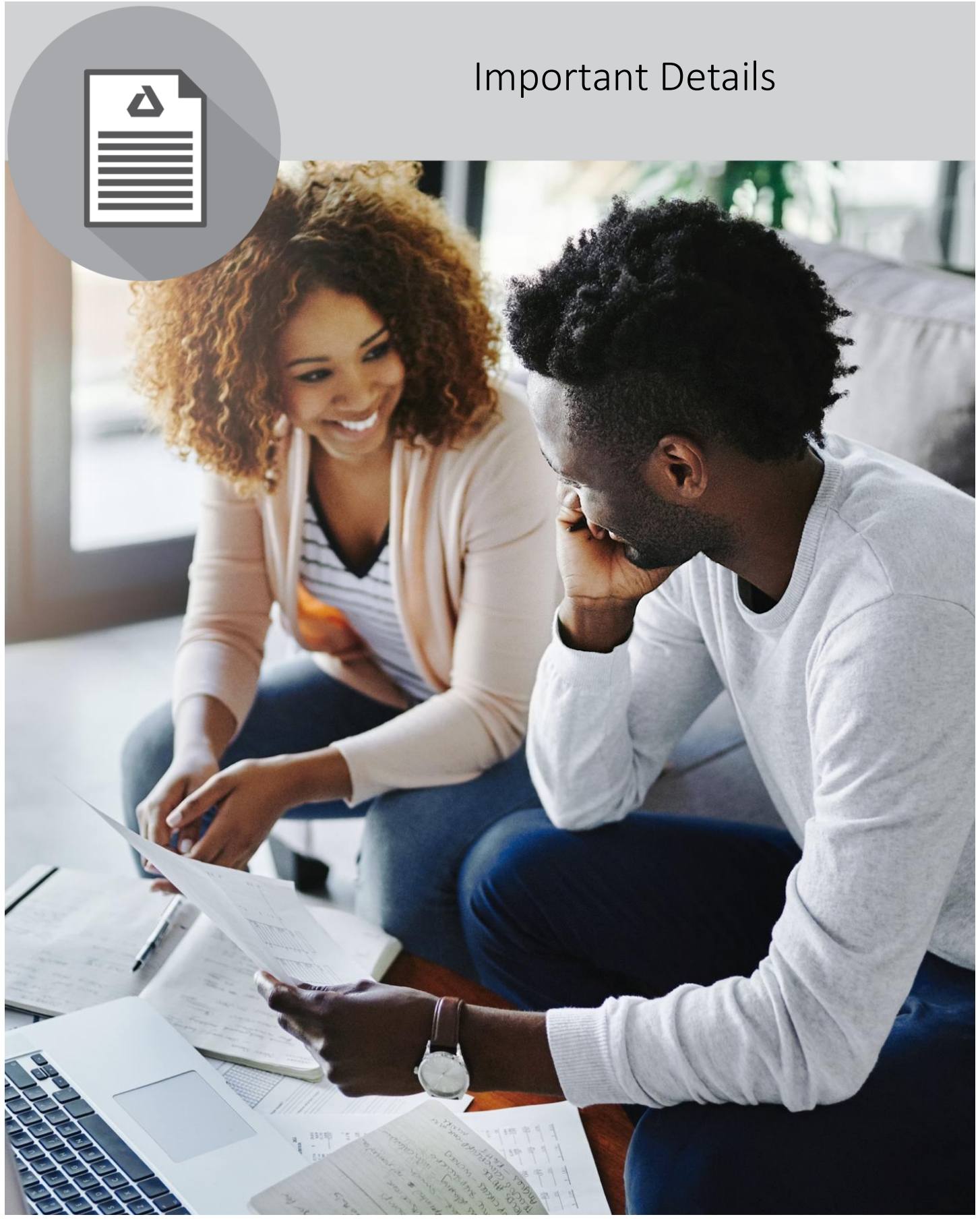
Remember that your plan is a contract between you and us. This section gives you more information about our obligations to you, and your obligations to us.