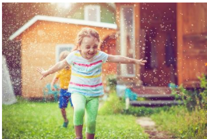
Children 0-18 years of age