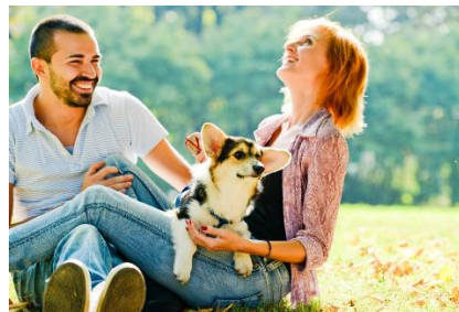
Adults 19 years of age and up