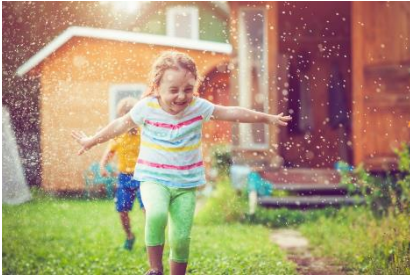
Children 0-18 years of age