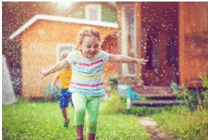
Children 0-18 years of age