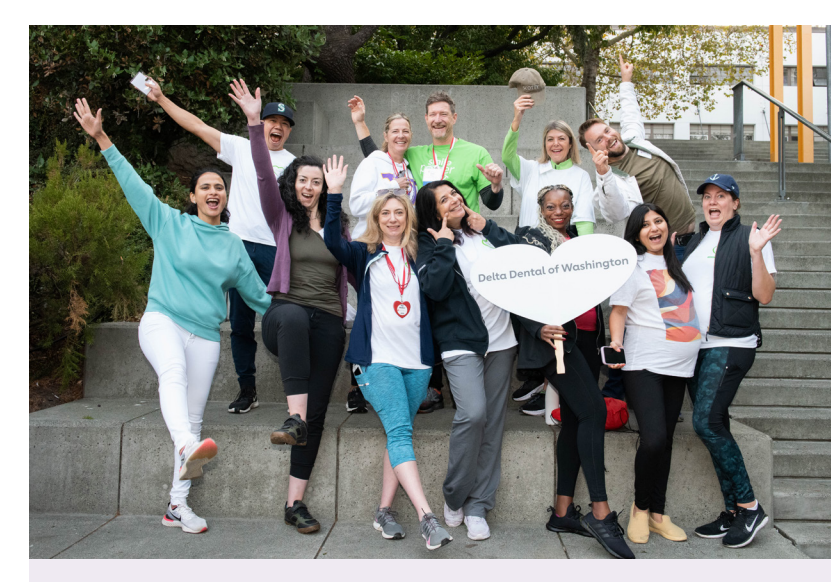
Delta Dental team at 2022 Heart and Stroke Walk.

<u>Second Harvest</u> - supporting food banks, meal sites and other programs feeding people in need in Eastern Washington