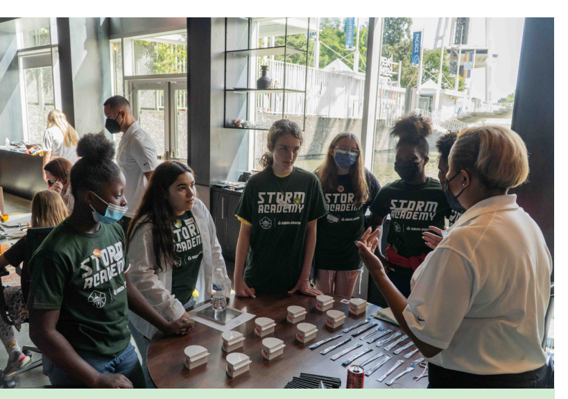
Inspiring girls to consider dentistry at Seattle Storm Academy.

We are optimistic that some of these youth will be inspired to pursue dental careers in Washington.