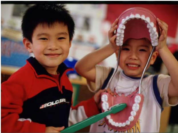
Learning good oral health through dramatic play