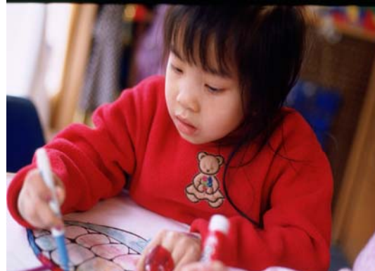
Learning about mouth germs through art activity

The curriculum was pilot tested in a multicultural setting with input from both parents and teachers. Their feedback on the cross-cultural health values and norms was incorporated into the curriculum. The parent handouts are available in six languages in addition to English: Spanish, Russian, Cambodian, Chinese, Somali and Vietnamese.