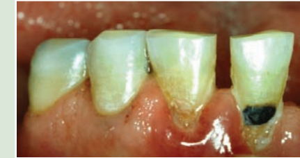
An example of root cavities, a common consequence of dry mouth.